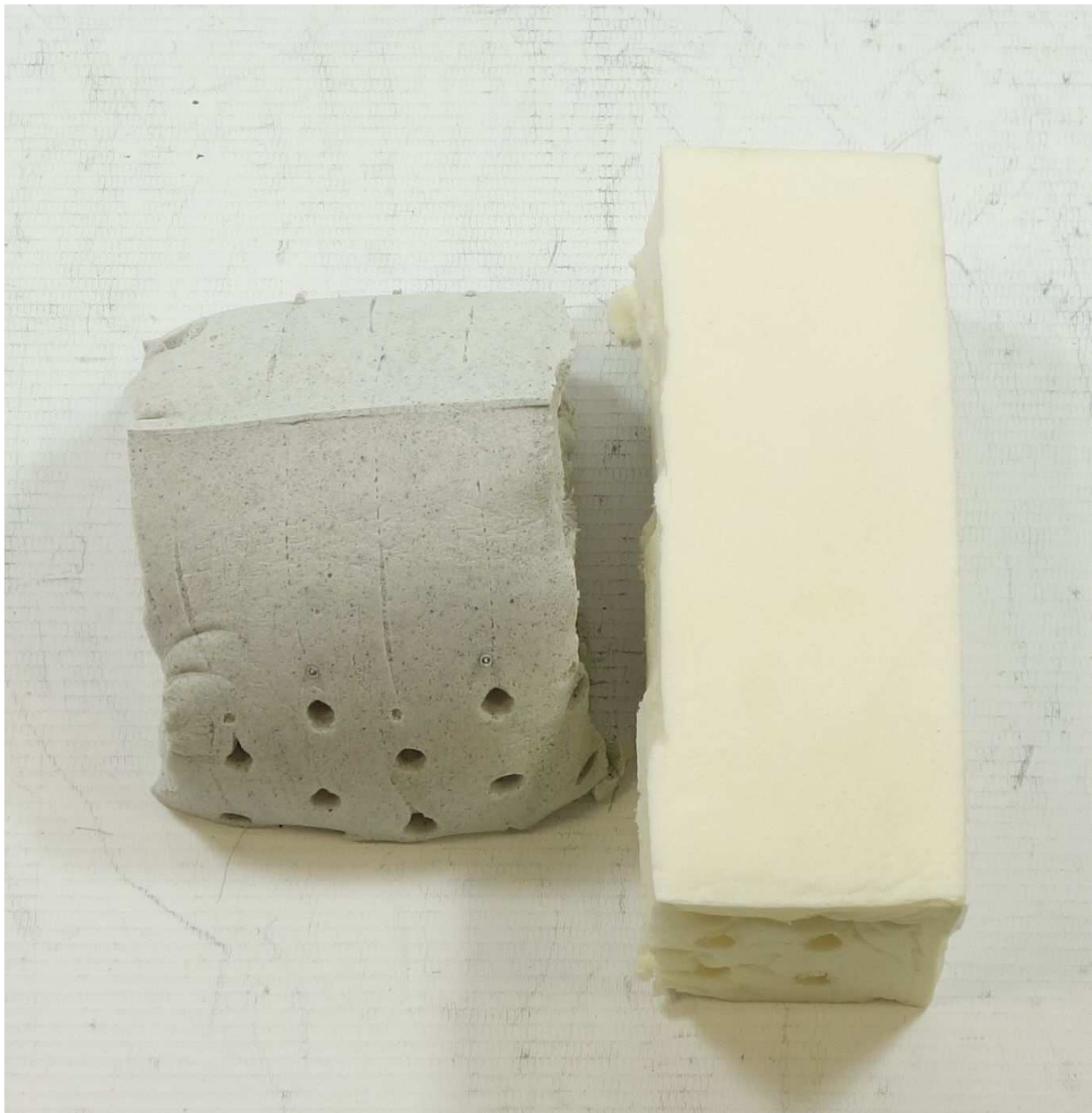
A001: C. Fusion Latex Pillow, Oval Pillow